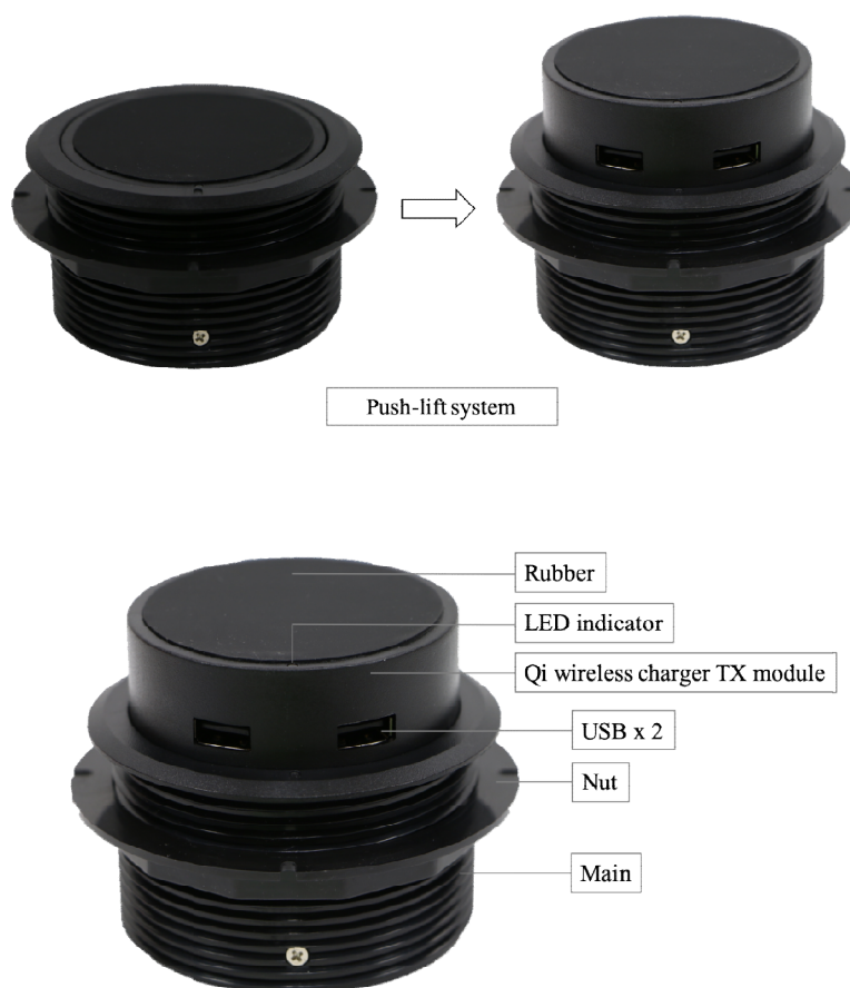
Figure 1. The block diagram of QI-02N